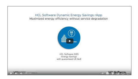
Maximizing energy efficiency with HCLSoftware's iDES rApp