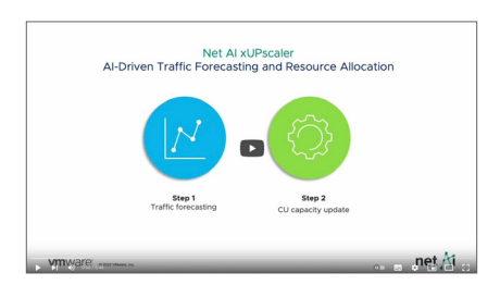
Forecasting RAN Traffic and Autoscaling Resources with a Net Al xApp on VMware RIC