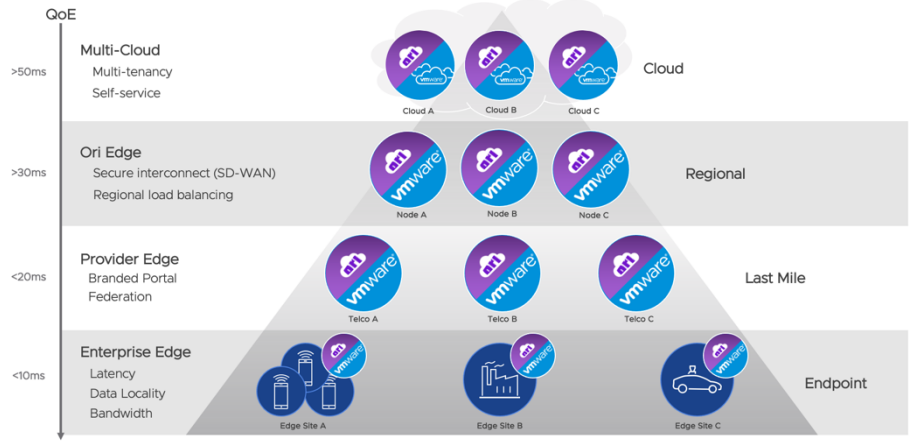
FIGURE 1: Different requirements and challenges at the edge