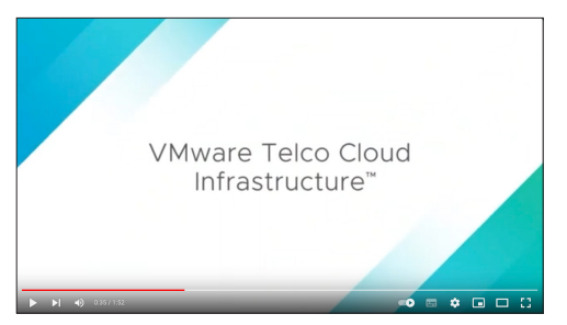
Demo video: An overview of the capabilities of VMware Telco Cloud Infrastructure