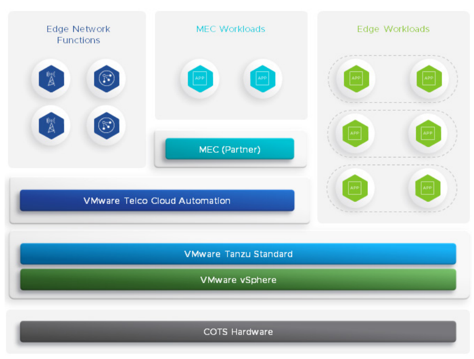
FIGURE 2: The architecture of VMware Telco Cloud Platform Edge enables you to fulfill various edge use cases with ease and consistency.